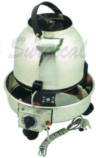
B - WITH TIMER