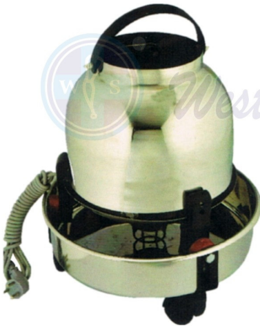
A - WITHOUT TIMER