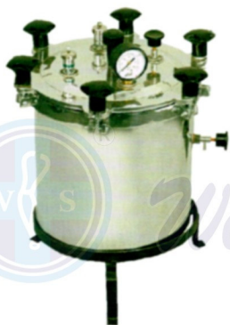
AUTOCLAVES ALUMINIUM WINGED NUTS TYPE