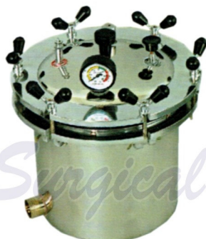
AUTOCLAVES STAINLESS STEEL WINGED NUTS TYPE