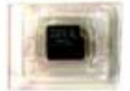
MMC SDHC CARD