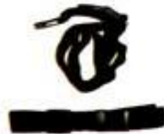
SHOULDER BELT WAIST BELT