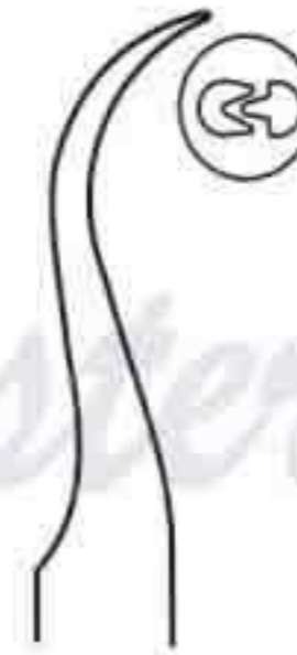
7417 Toothed No.7