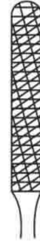
T.C.-17124 MEDIUM CUTTING