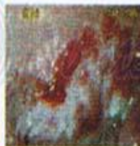
Grade - I green filter image