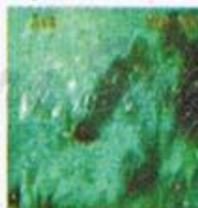
Grade-II green filter image