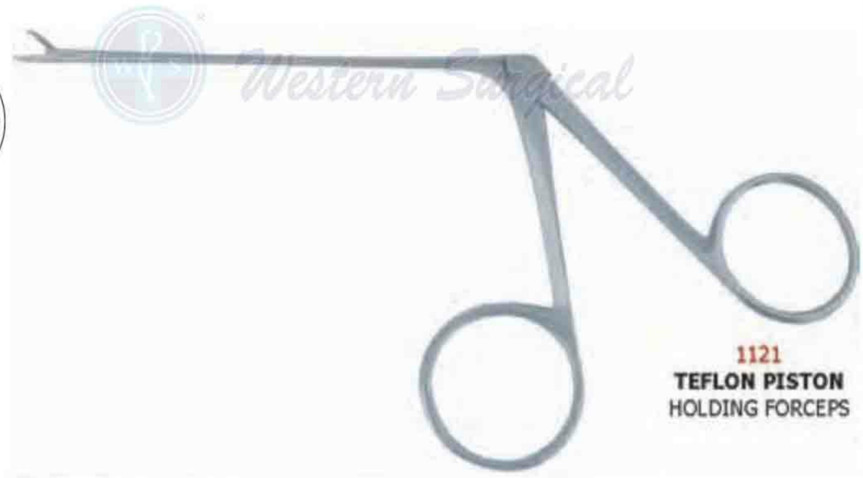
1121 TEFLON PISTON HOLDING FORCEPS