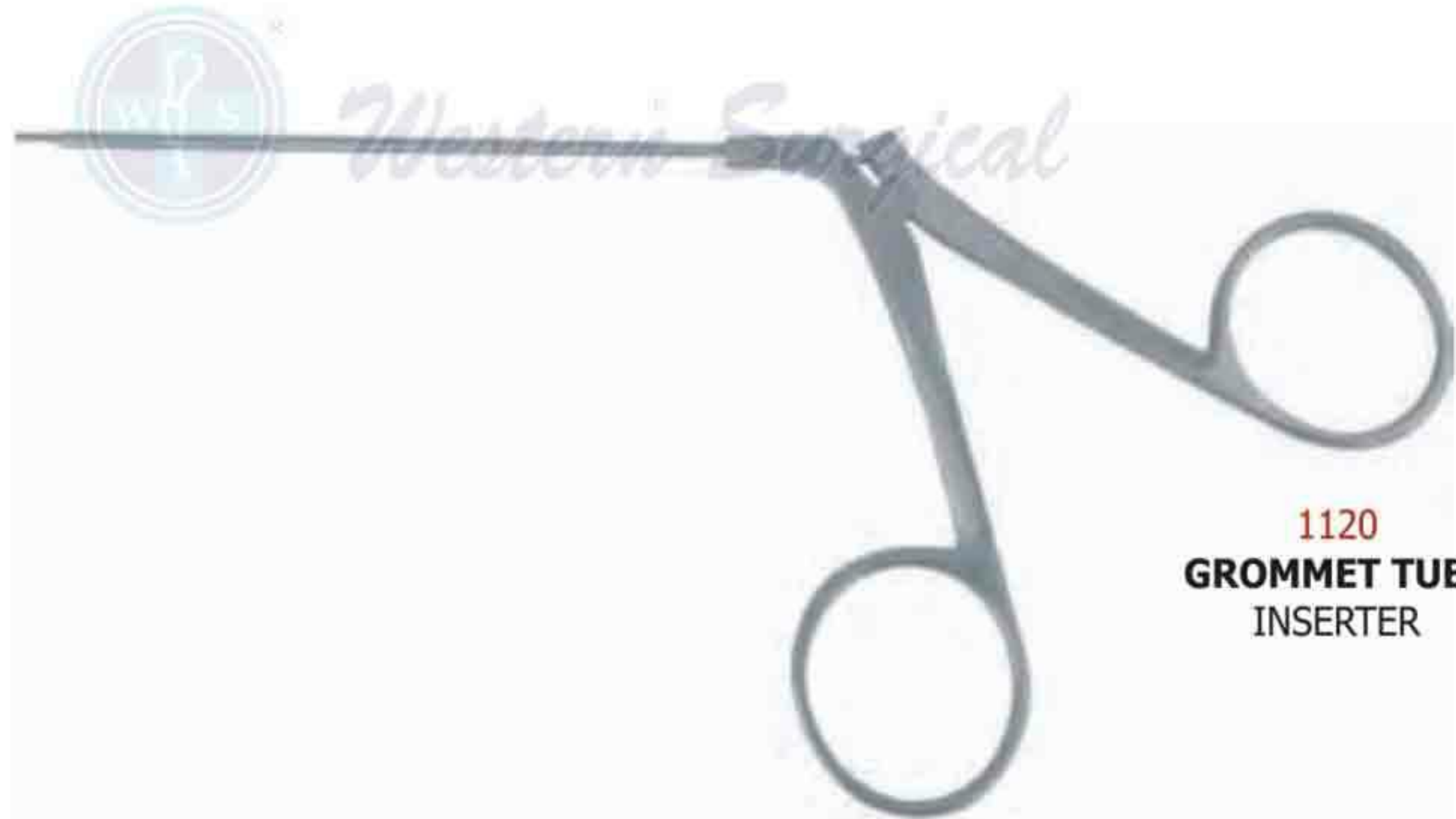
1120 GROMMET TUBE INSERTER